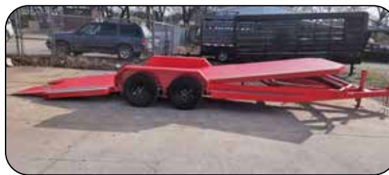
Heavy Equipment Tilt Trailer $6,995