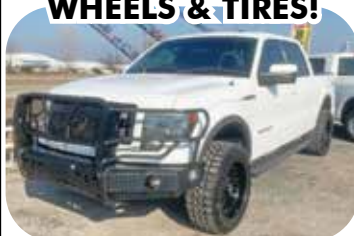
2014 FORD F-150 LIFTED WHEELS & TIRES!