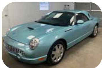
2002 FORD THUNDERBIRD ONLY 66K MILES