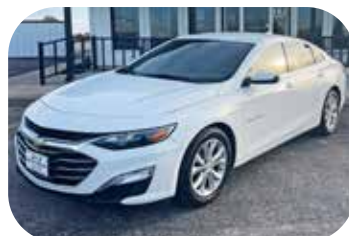
2021 CHEVY MALIBU LT