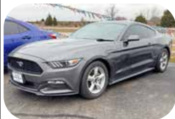
2017 FORD MUSTANG AUTO • V6