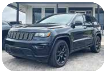
2017 JEEP GRAND CHEROKEE 4X4