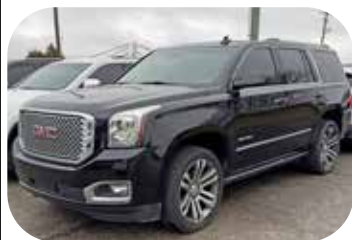
2017 GMC YUKON DENALI