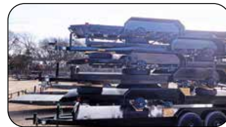
16' Utility Trailer $2,295