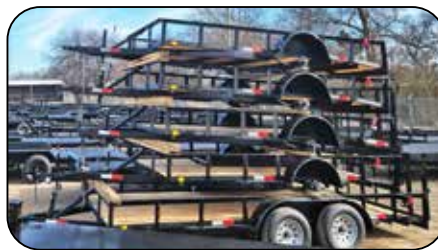
12' Utility Trailer $1,895