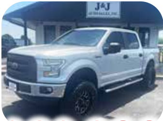
2017 FORD F-150 LIFTED CUSTOM WHEELS / TIRES