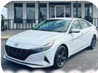
2023 HYUNDAI ELANTRA 9687 MILES • GREAT MPG