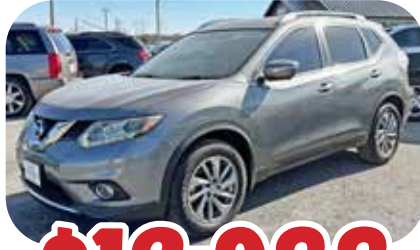
2014 NISSAN ROGUE SL LEATHER