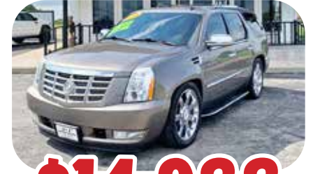
2012 CADILLAC ESCALADE