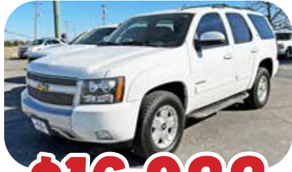
2012 CHEVY TAHOE Z-71 LOADED • 140K MILES