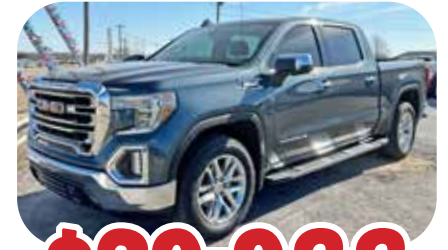
2019 GMC SIERRA 1500 SLT 4X4 • 85K MILES