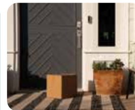
Know When People and Packages Arrive