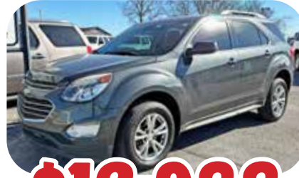
2017 CHEVY EQUINOX LT AWD