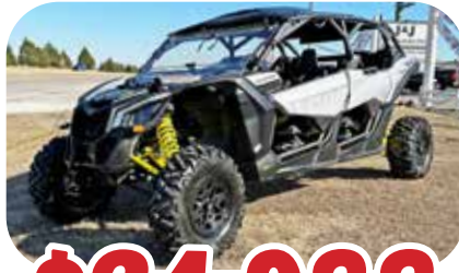
2019 CAN-AM MAVERICK MAX X3