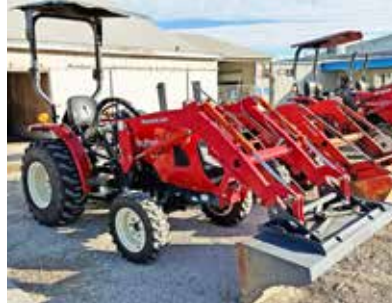
Branson 3515R 35 HP Diesel - 4WD With Loader