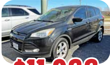
2015 FORD ESCAPE NEW TIRES

14477 US HWY. 70, LONE GROVE VISIT JJAUTOSOK.COM FOR FULL INVENTORY & EASY ONLINE APPLICATION!