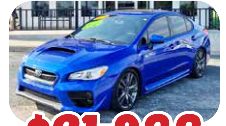
2016 SUBARU WRX