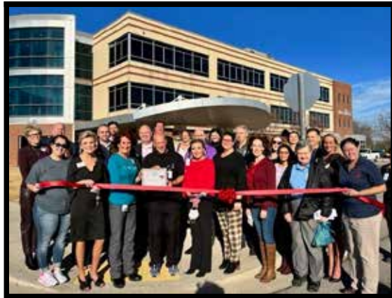
Congratulations to Mercy Ear, Nose and Throat Clinic on their recent Ribbon Cutting!