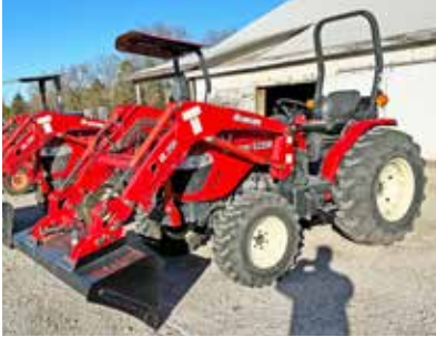
Branson 5220R 55 HP Diesel - 4WD With Loader