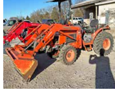
Kubota B3030 30 HP Diesel - 4WD With Loader