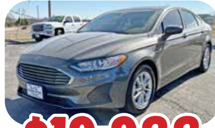
2019 FORD FUSION ECOBOOST • 52K MILES