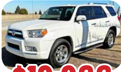
2013 TOYOTA 4RUNNER SR5