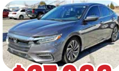
2020 HONDA INSIGHT GREAT MPG • 31K MILES