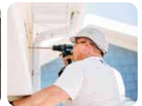
Get FREE Professional Installation and Four FREE Months of Monitoring Service*

One Connected System For Total Peace of Mind