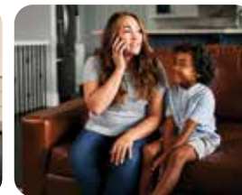
Peace of Mind Starts Here