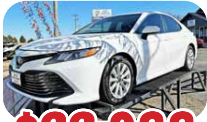
2020 TOYOTA CAMRY LE NEW TIRES • 49K MILES