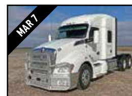
DM2678 '15 Kenworth T680 semi truck