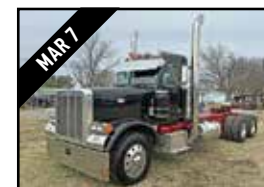
OM9835 '99 Peterbilt 379 semi truck