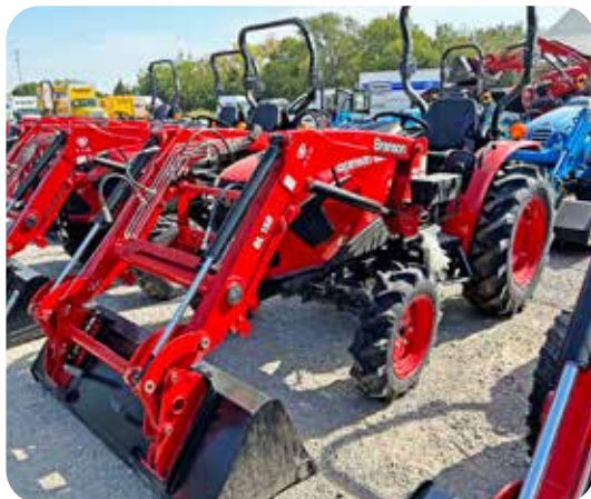
TYM / Branson 4215R 42 HP - Shuttle Shift FREE LOADER

ZERO DOWN - $316 per Month! WAC - 84 Month Financing Available