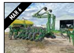
OJ9438 John Deere 1770NT no-till planter