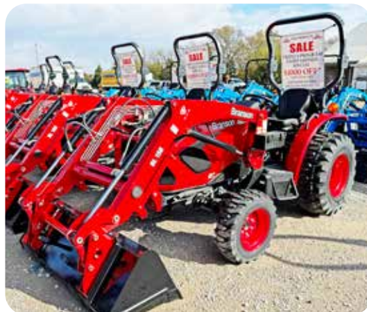
TYM / Branson 3015R 30 HP - Shuttle Shift FREE LOADER

ZERO DOWN - $316 per Month! WAC - 84 Month Financing Available