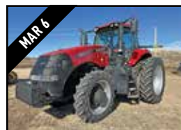
DH1927 '17 Case IH Magnum 250 MFWD tractor