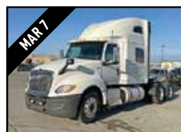
OF9279 '18 Int'l LT625 semi truck