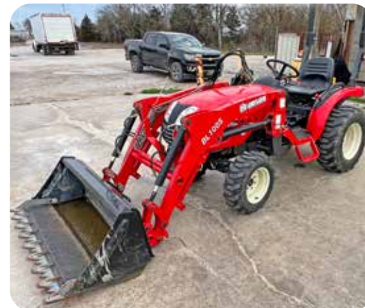
Branson 2510H 25 HP - Hydrostatic Transmission Front End Loader

ZERO DOWN - $300 per Month! WAC - 84 Month Financing Available