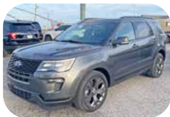
2018 FORD EXPLORER SPORT