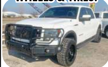
2014 FORD F-150 LIFTED WHEELS & TIRES!