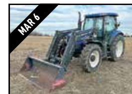
OM9820 '05 New Holland TS115A MFWD tractor