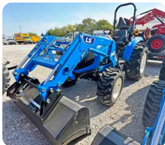
LS Tractor MT357 PCT 57 HP - Power Clutch Transmission FREE LOADER

ZERO DOWN - $374 per Month! WAC - 84 Month Financing Available