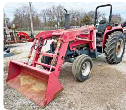
Mahindra 5500 55 HP - Gear Drive Front End Loader

ZERO DOWN - $406 per Month! WAC - 84 Month Financing Available