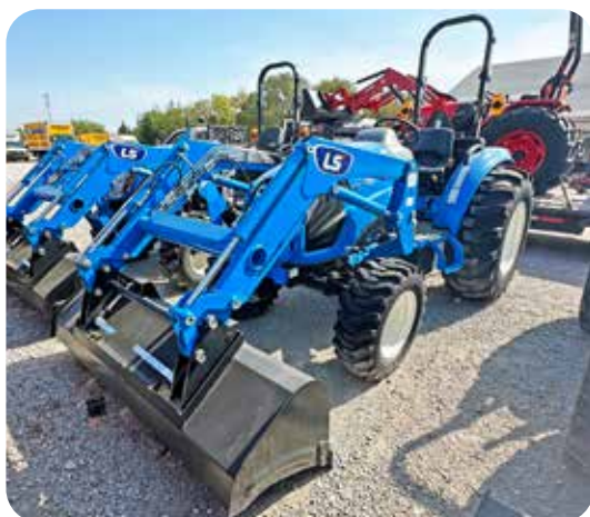
LS Tractor MT345 HST 45 HP - Hydrostatic Transmission FREE LOADER

ZERO DOWN - $374 per Month! WAC - 84 Month Financing Available