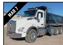
DM7732 '16 Kenworth T880 dump truck