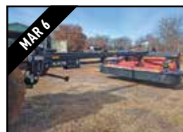
OD9221 '19 Kubota DMC8540R swather / windrower