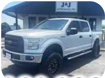
2017 FORD F-150 LIFTED CUSTOM WHEELS / TIRES