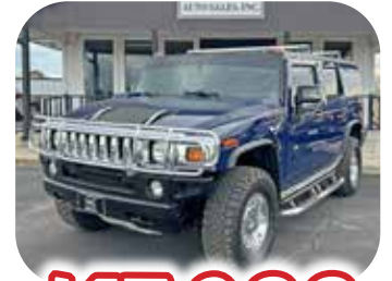
2007 HUMMER H2 CUSTOM STEREO • 3RD ROW