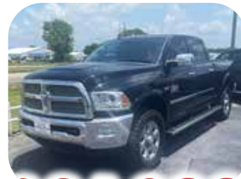
2014 RAM 2500 4X4 • HEMI