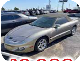
2001 FIREBIRD V6 • AUTO • SHOW QUALITY