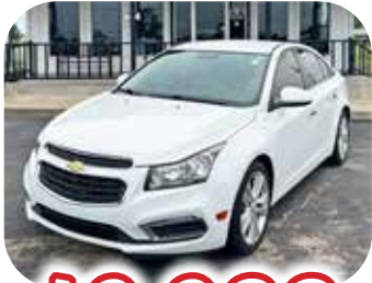
2015 CHEVY CRUZE LTZ • GREAT MPG