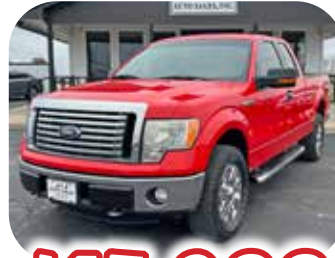
2011 FORD F-150 EXT. CAB • 4X4