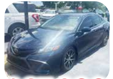
2021 TOYOTA CAMRY NIGHTSHADE ONLY 11K MILES!