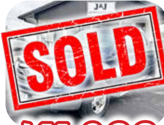
2010 FORD F-150 SUPERCREW • 5.0