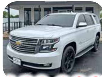
2017 CHEVY TAHOE PREMIER • 4X4