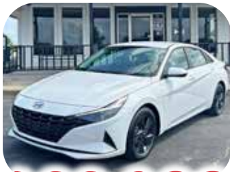
2023 HYUNDAI ELANTRA 9687 MILES • GREAT MPG