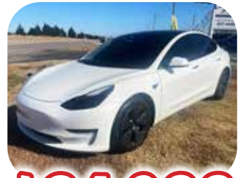
2021 TESLA MODEL 3 DUAL MOTOR