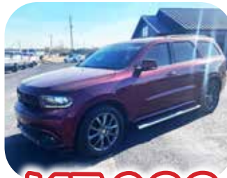
2018 DODGE DURANGO R/T • ONLY 72K MILES