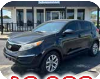
2015 KIA SPORTAGE AWD