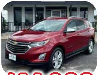
2019 CHEVY EQUINOX PREMIER • HARD LOADED