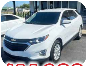
2020 CHEVY EQUINOX LT