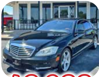
2010 MERCEDES S550 $107K MSRP