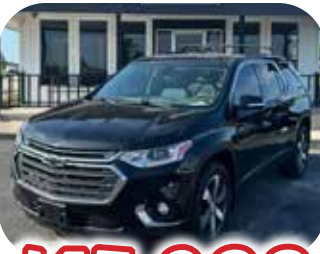
2018 CHEVY TRAVERSE LT • NEW TIRES • AWD