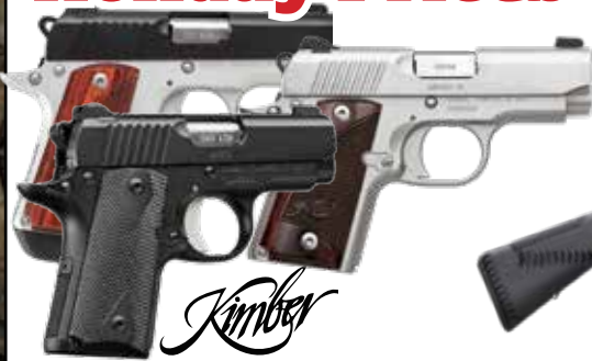
KIMBER MICRO 9