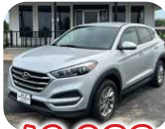
2018 HYUNDAI TUCSON NEW TIRES