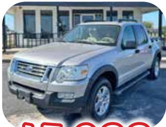
2007 FORD EXPLORER SPORT TRAC