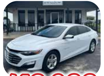
2020 CHEVY MALIBU NICE RIDE