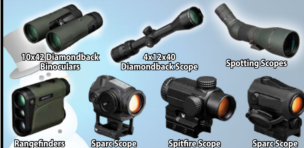
10x42 Diamondback Binoculars